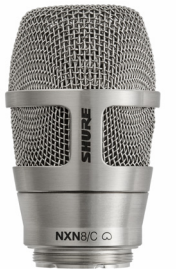
RPW202 Nexadyne 8/C Cardioid Dynamic Vocal Microphone Wireless Capsule for Shure Handheld Transmitters (Nickel)