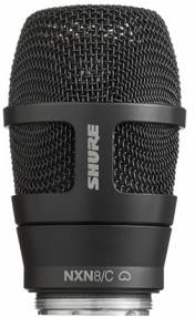
RPW200 Nexadyne 8/C Cardioid Dynamic Vocal Microphone Wireless Capsule for Shure Handheld Transmitters (Black)