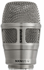
RPW206 Nexadyne 8/S Supercardioid Dynamic Vocal Microphone Wireless Capsule for Shure Handheld Transmitters (Nickel)