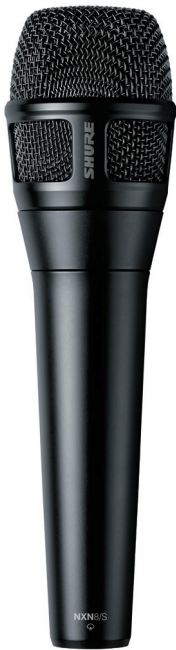
NXN8/S Nexadyne™ 8/S Supercardioid Dynamic Vocal Microphone