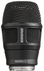
RPW204 Nexadyne 8/S Supercardioid Dynamic Vocal Microphone Wireless Capsule for Shure Handheld Transmitters (Black)